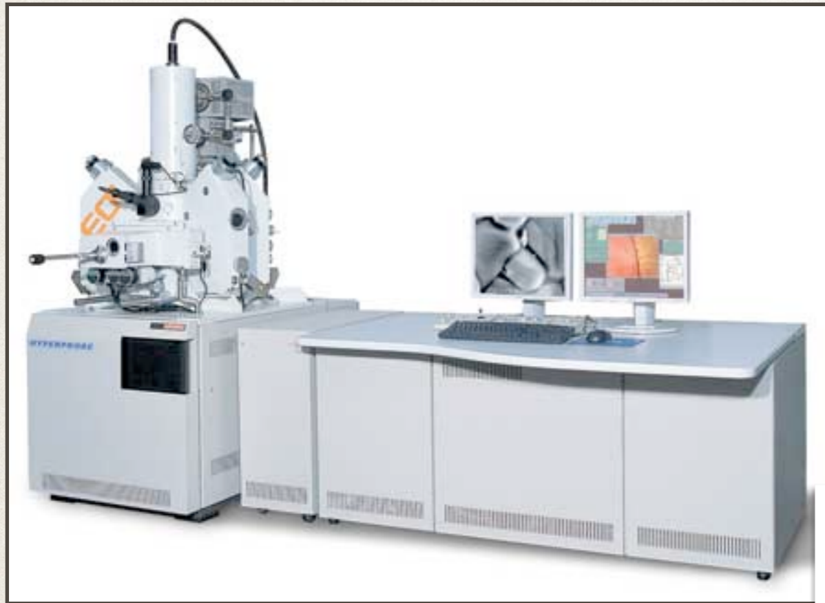
Electron probe microanalyzer